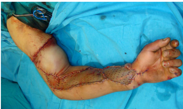
Fig. 3 Appearance of the extremity immediately after the cross-over replantation. Fasciotomy defects are covered with split thickness skin grafts, harvested from the amputated extremity

The total ischemia time was noted as 11 h and the total surgery time was 8.5 h. The patient's vital signs and right limb revascularization were continuously monitored. Most of the vital and clinical parameters stayed within the normal range during the early post-operative days. At the 9th post-operative day, signs of a purulent infection were noted. The specimens revealed a pseudomonas infection. At the 11th post-operative day, muscle and skin necrosis was evident over the biceps region. After serial debridements and