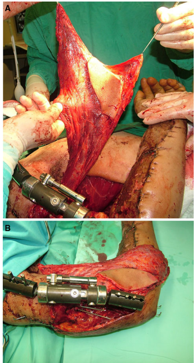
Fig. 4 Pedicled latissimus dorsi muscle transfer was performed simultaneously with the substitution of osteosynthesis plates with an external fixation device

Subsequently, there were no major circulatory or soft tissue problems. A splint was applied with the elbow at 100° of flexion and the forearm at maximum supination. The patient was discharged at the 26th postoperative day. During discharge, the patient's hemoglobin value was