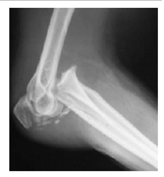
Figure 1 Preoperative radiograph of type IIIB olecranon fracture.

For antimicrobial prophylaxis, a first-generation cephalosporin (cefazolin sodium [Sefazol; Mustafa Nevzat, Istanbul, Turkey]) was used intravenously, with 2 g injected 30 minutes before surgery and 1 g injected every 6 hours for the first 2 postoperative days in all patients.