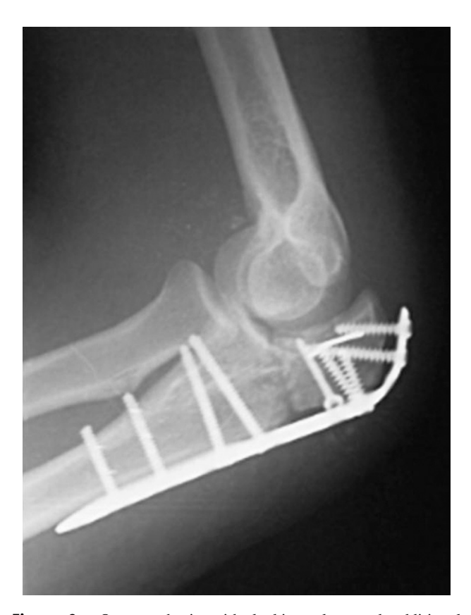
Osteosynthesis with locking plate and additional Figure 2 screw and Kirschner wire.